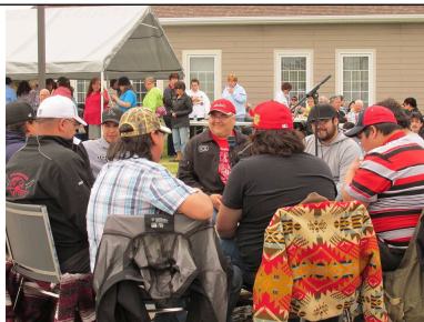
Eastern Eagle Drum