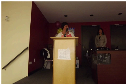
Mayor Pam Mood